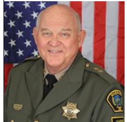
Sheriff Ken Matlack

"I'm very happy that our deputies continue to serve our citizens and community at such a high level of excellence." – Sheriff Ken Matlack